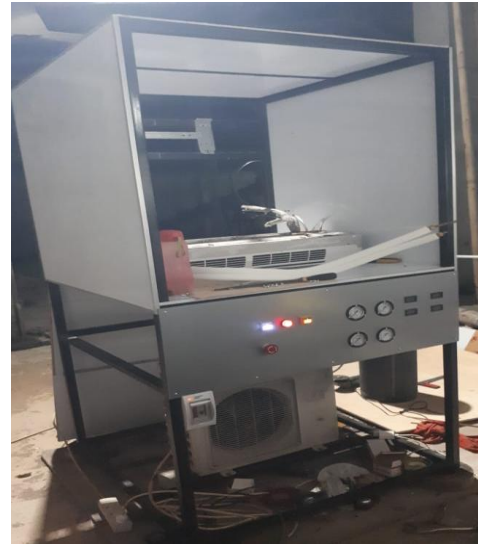
Figure 1. Test equipment installation

Temperature data collection is done using a digital thermometer, and to collect pressure data using a pressure gauge. gauge, and use an anemometer to measure the air velocity coming out of the evaporator fan.